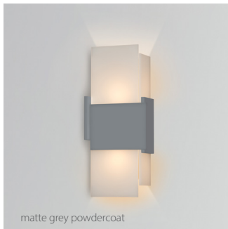
matte grey powdercoat