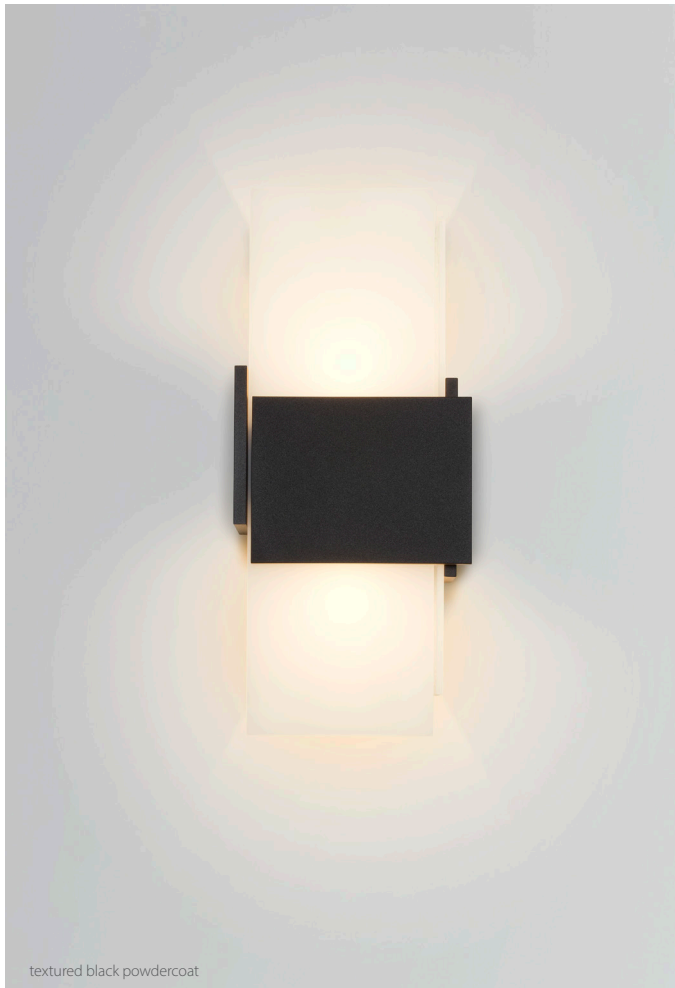
textured black powdercoat