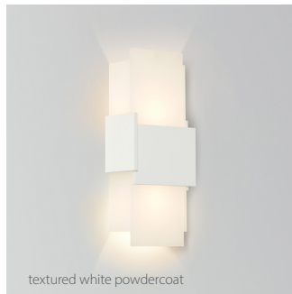
textured white powdercoat