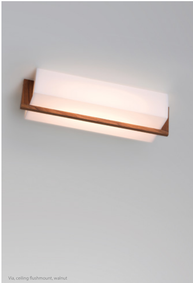
Via, ceiling flushmount, walnut

The Via has an understated geometry with sophisticated detailing and proportion. The substantial glowing volume of the Via is punctuated by a thin plane of rich American walnut striking a balance and harmony.