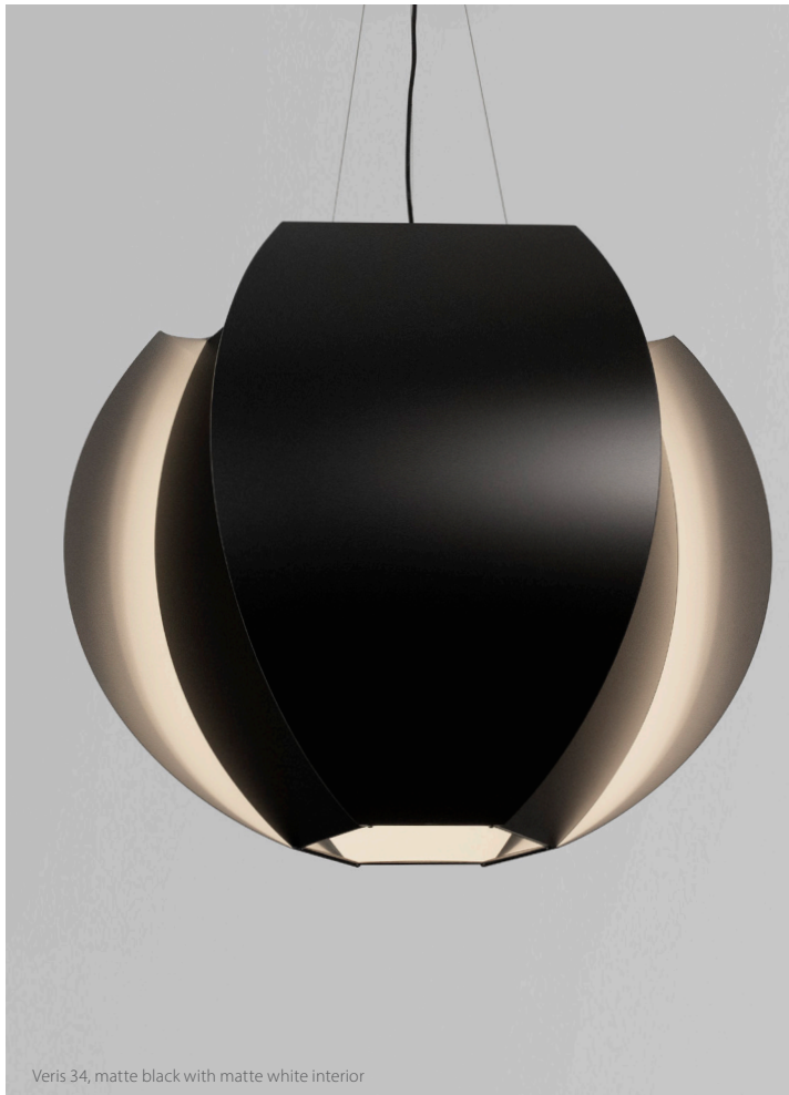
Veris 34, matte black with matte white interior