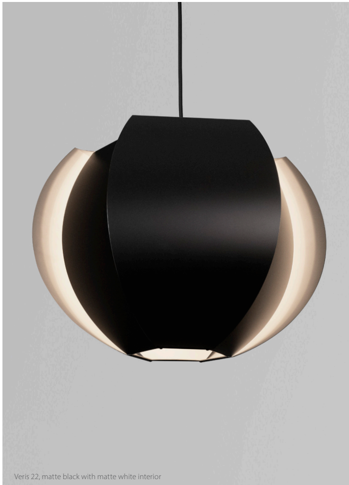
Veris 22, matte black with matte white interior