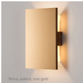
Tersus, walnut, rose gold