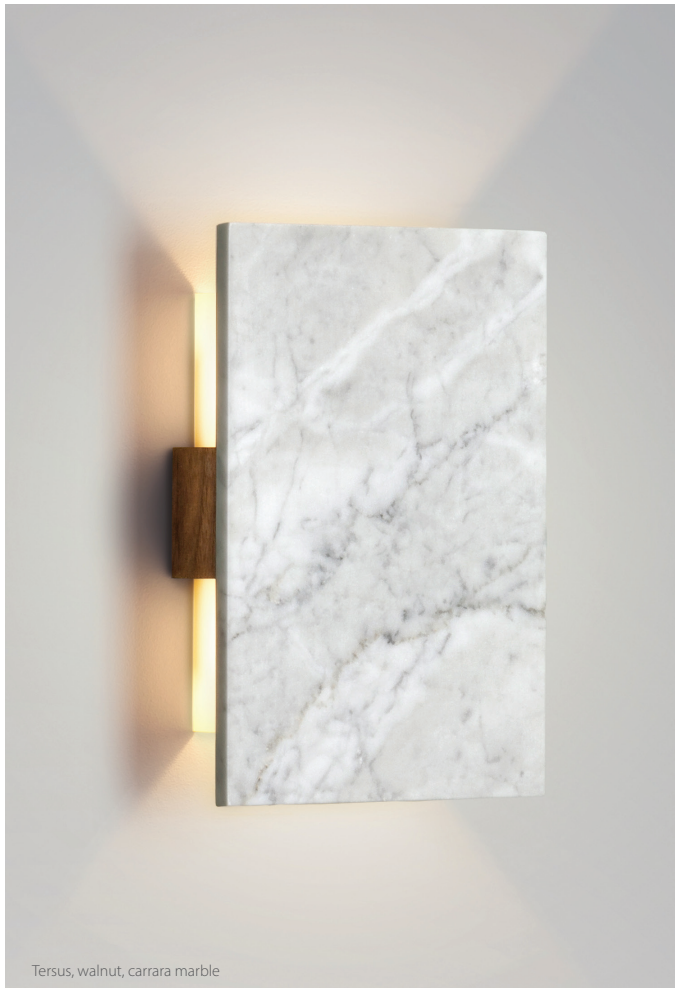
Tersus, walnut, carrara marble