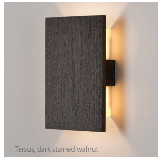
Tersus, dark stained walnut