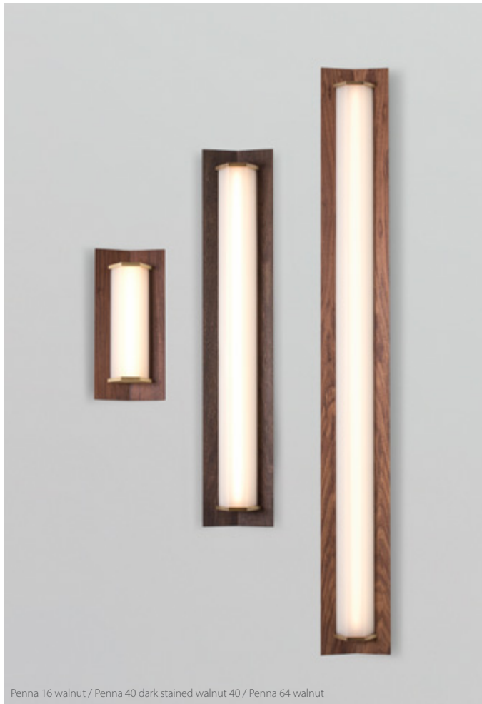
Penna 16 walnut / Penna 40 dark stained walnut 40 / Penna 64 walnut