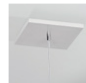
Mica low-profile square canopy