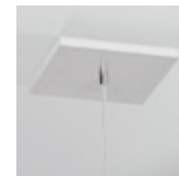
Levis low-profile square canopy