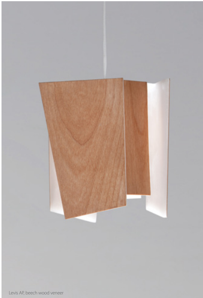
Levis AP, beech wood veneer