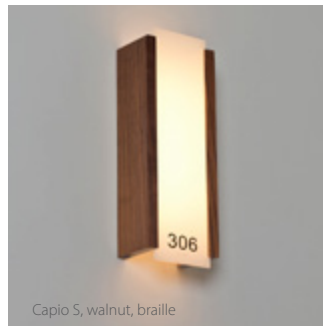
Capio S, walnut, braille