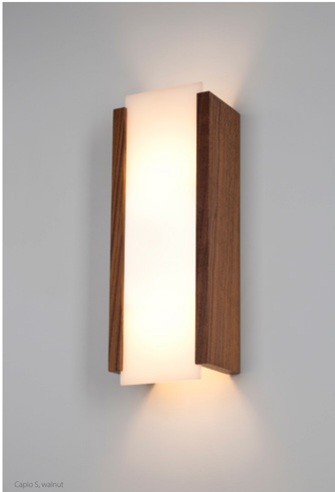
Capio S, walnut