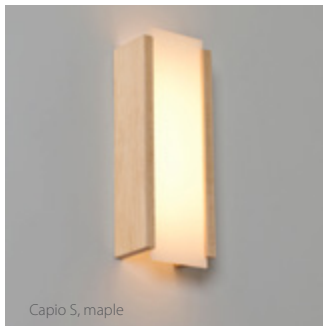
Capio S, maple