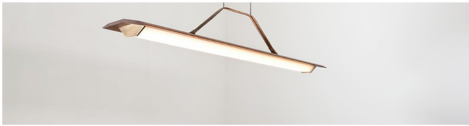
The Penna light from Cerno features a leather strap and gold embellishments.