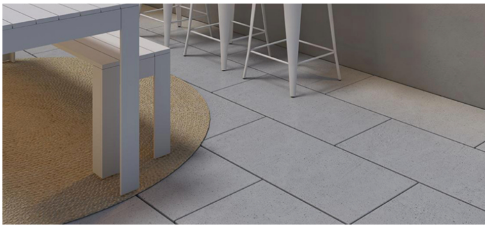
The minimal Acuo outdoor light from Cerno adds symmetry and shine to this laid-back patio.