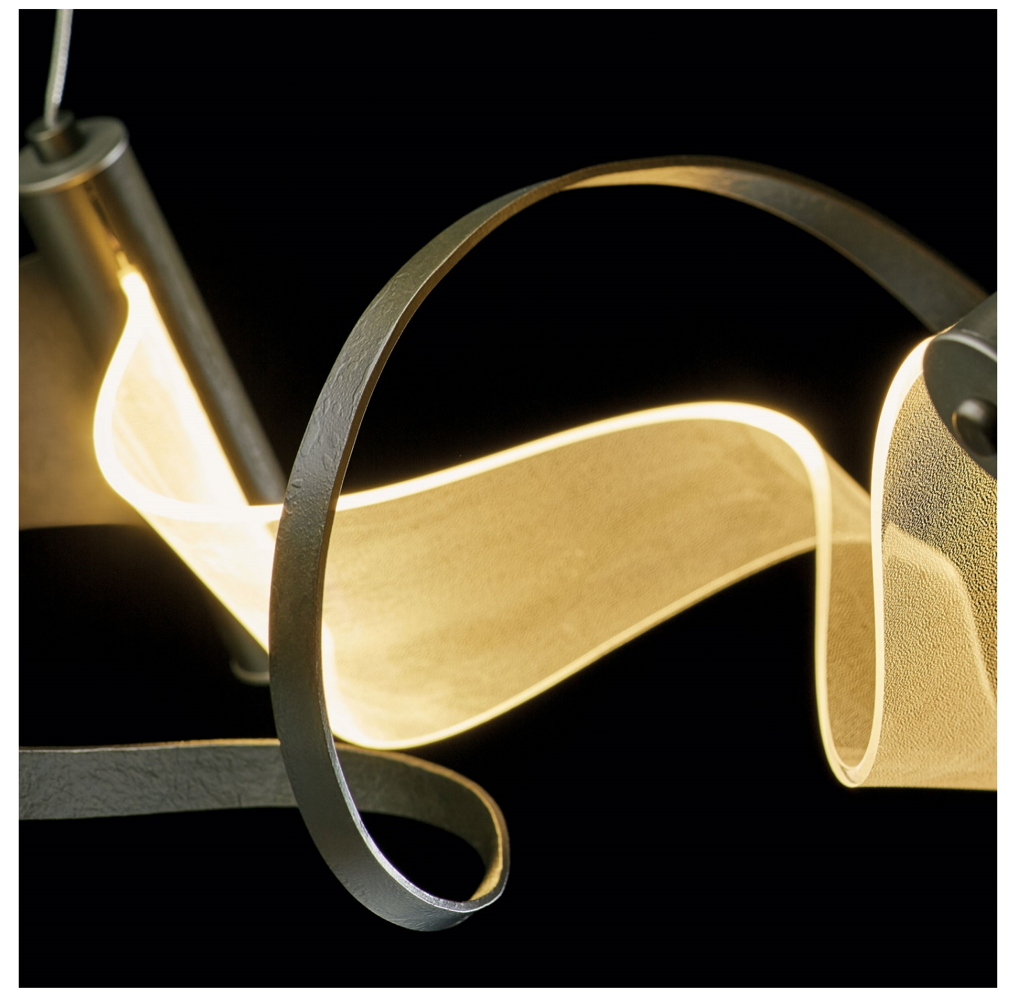
How It's Made: Zephyr Pendant Light (https://www.ylighting.com/blog/made-zephyr-led-pendant-light/)