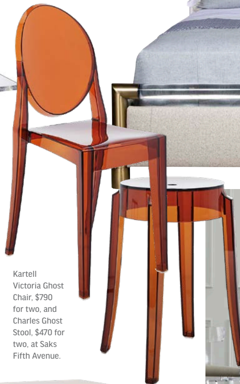
Kartell Victoria Ghost Chair, $790 for two, and Charles Ghost Stool, $470 for two, at Saks Fifth Avenue.