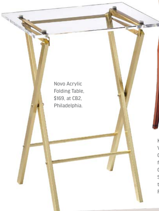
Novo Acrylic Folding Table, $169, at CB2, Philadelphia.