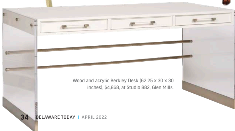
Wood and acrylic Berkley Desk (62.25 x 30 x 30 inches), $4,868, at Studio 882, Glen Mills.