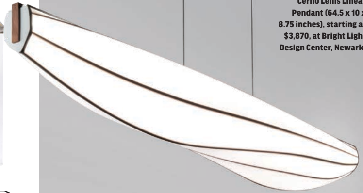
Cerno Lenis Linear Pendant (64.5 x 10 x 8.75 inches), starting at $3,870, at Bright Light Design Center, Newark.