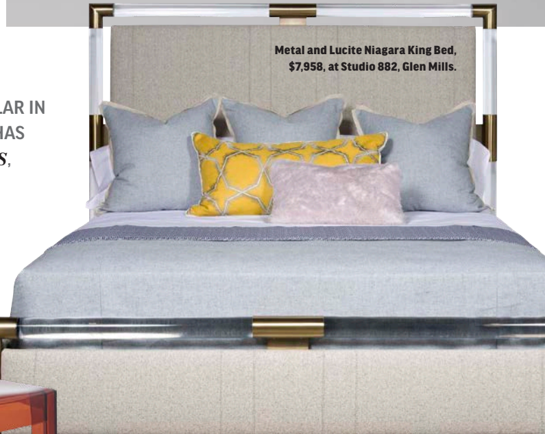
Metal and Lucite Niagara King Bed, $7,958, at Studio 882, Glen Mills.