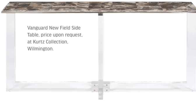
Vanguard New Field Side Table, price upon request, at Kurtz Collection, Wilmington.