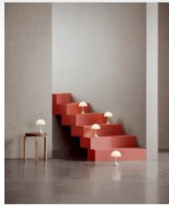
Pantella Portable Louis Poulsen louispoulsen.com