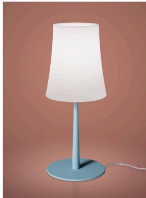
Bird Easy Foscarini foscarini.com