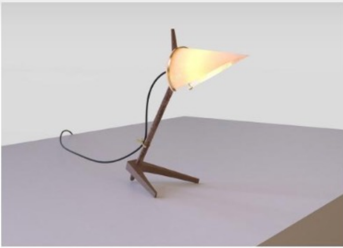
Armitage Lamp Joe Armitage thenewcraftsmen.com