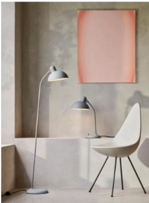
KAISER Idell Fritz Hansen fritzhansen.com