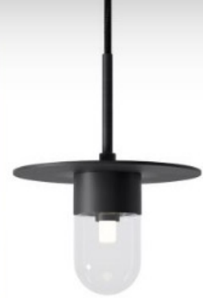
EVERYDAY Stellar Works stellarworks.com