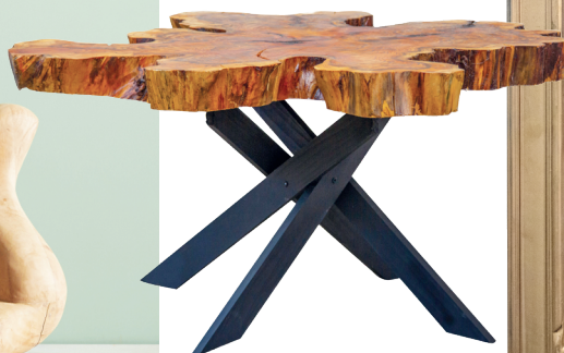
Chad Dorsey's Tree Unique Table, $800, at Su Casa Furniture, Ocean View.