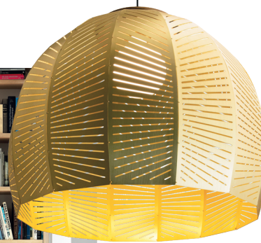
Cerno Amicus Pendant, starting at $950, at Bright Light Design Center, Newark.