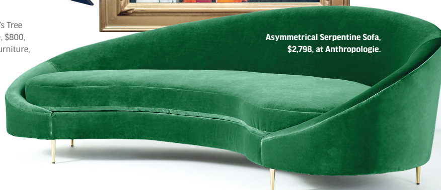
Asymmetrical Serpentine Sofa, $2,798, at Anthropologie.