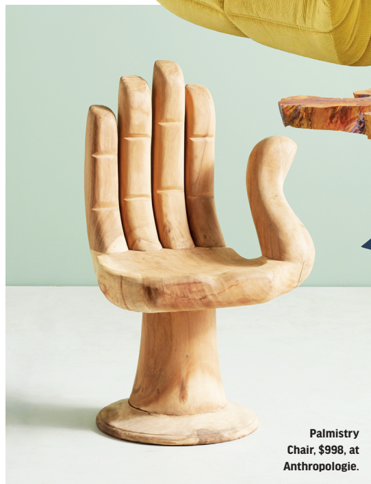
Palmistry Chair, $998, at Anthropologie.