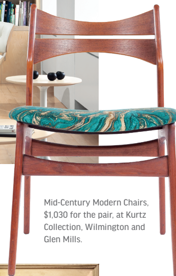
Mid-Century Modern Chairs, $1,030 for the pair, at Kurtz Collection, Wilmington and Glen Mills.