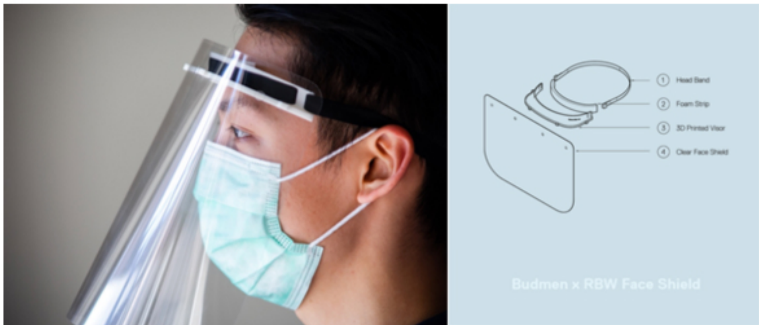
The Richard Brilliant Willing face shield

A rendering of the Emergency Field Hospital Bed by Loll DesignsLoll Designs, with its knowledge of making sustainable outdoor furnishings, is making hospital beds and additional safety equipment from durable and sanitary HDPE (high density polyethylene). Hygienic, easily cleanable and 100 percent recyclable, the Emergency Hospital Field Beds can be assembled on-site and allow hospitals to admit more patients.