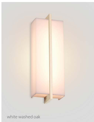
white washed oak