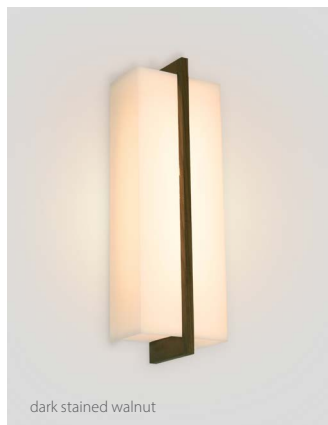
dark stained walnut

The Via has an understated geometry with sophisticated detailing and proportion. The substantial glowing volume of the Via is punctuated by a thin plane of rich American walnut striking a balance and harmony.