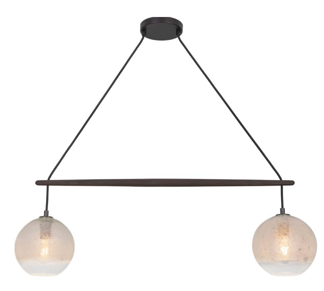
clear bubble, dark stained walnut crossbar, dark bronze , black cord