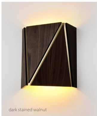
dark stained walnut