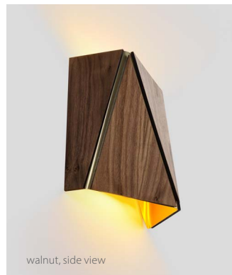
walnut, side view