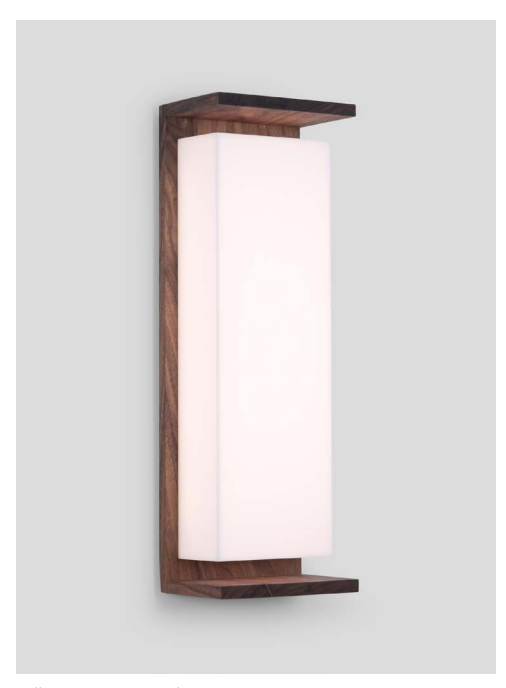
Balboa sconce 18, walnut, 3000K.

Metal and powder coated fixtures are constructed of solid aluminum bar stock.