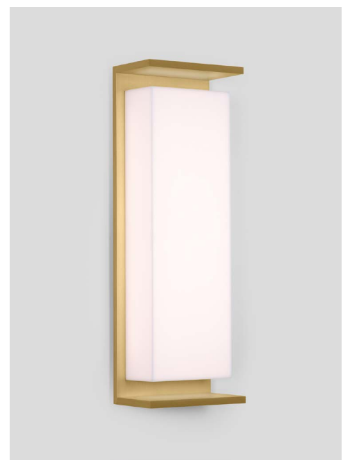
Balboa sconce 18, brass, 3000K.