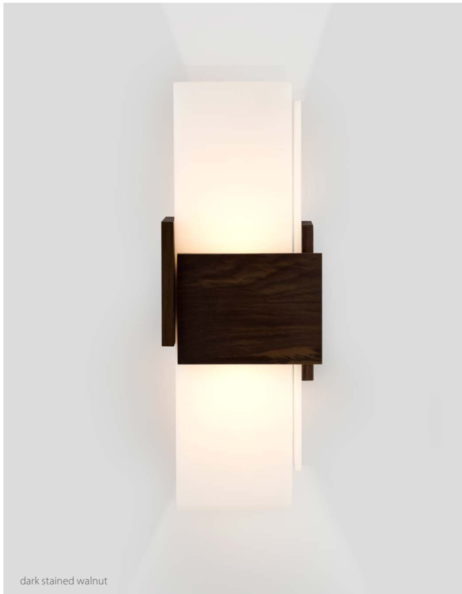
dark stained walnut