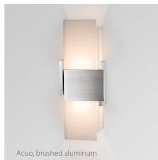
Acuo, brushed aluminum

"It's a 3 sided box, which has been carefully deconstructed to a sculptural state. The careful composition of overlap and void create interest and complexity to a very straightforward, well-functioning wall sconce. The tectonic disconnection in form allows you to witness the solid American black walnut's grain as it travels through each solid block."