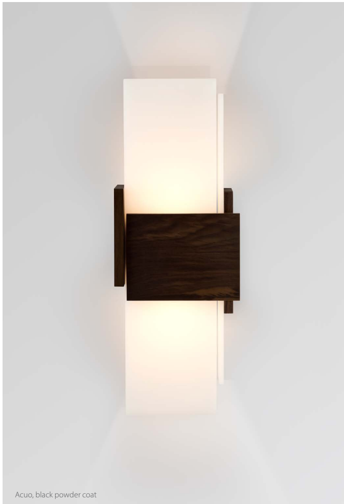
Acuo, black powder coat