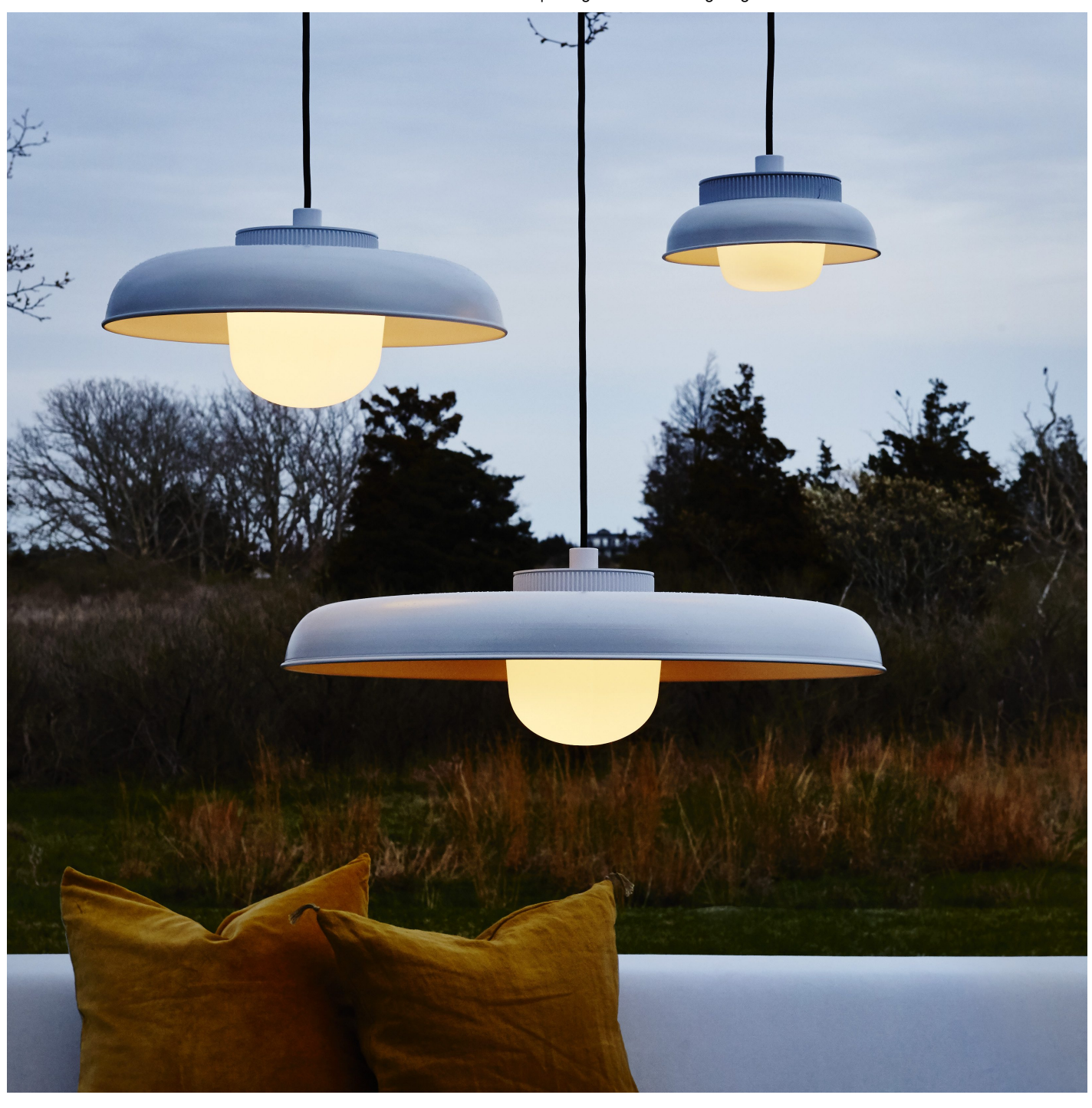
Hoist: Modern Lighting Born on a Boat (https://www.ylighting.com/blog/hoist-modern-lighting-born-on-boat/)