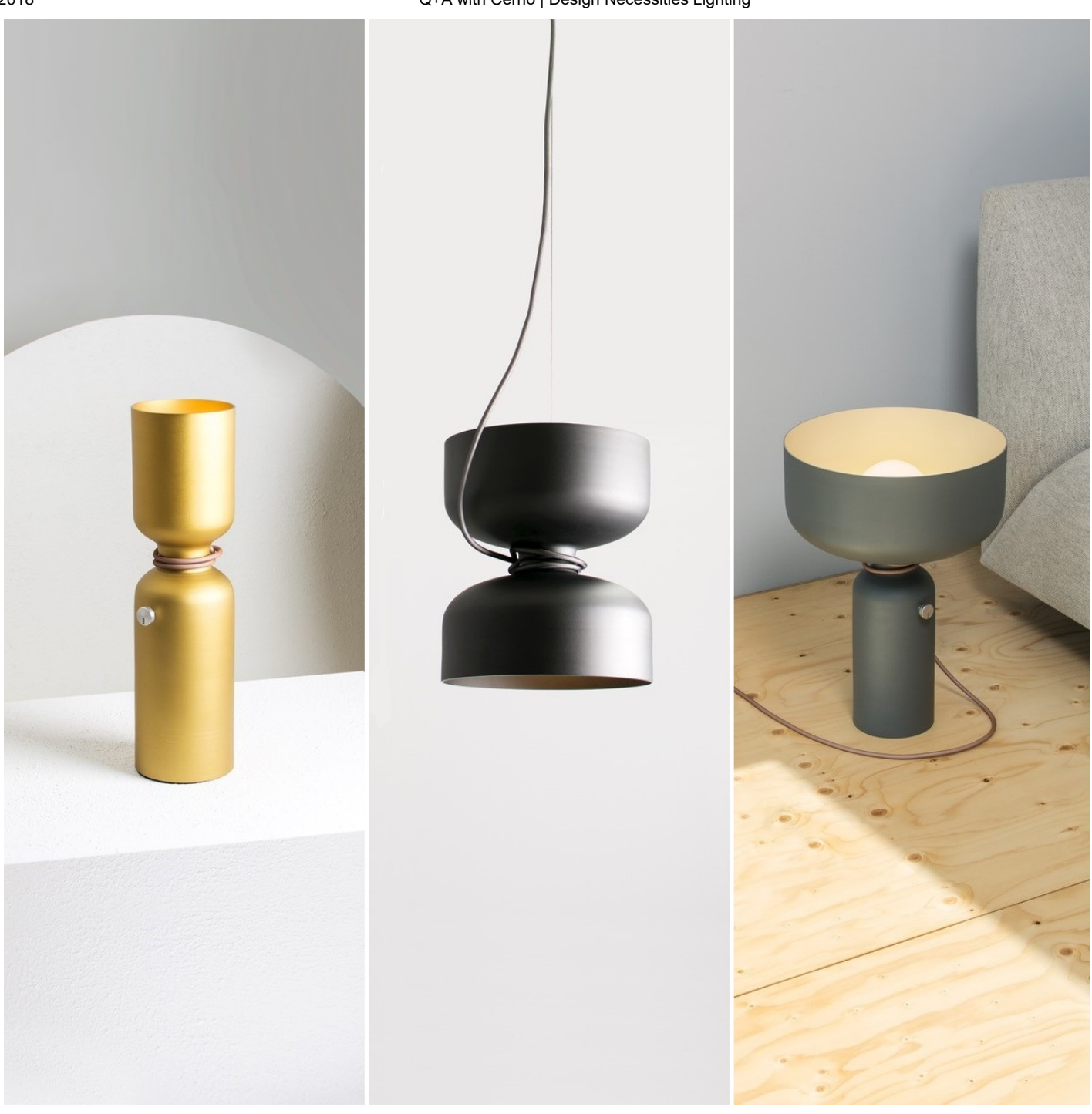
In the Spotlight: A Q+A with ANDlight (https://www.ylighting.com/blog/in-the-spotlight-youre-the-lighting-designer/)