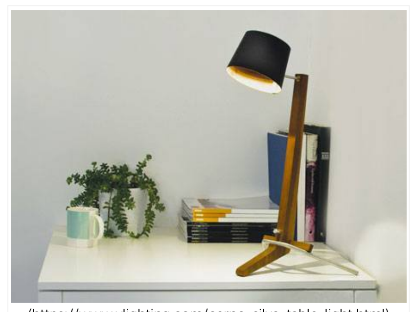
(https://www.ylighting.com/cerno-silva-table-light.html) Silva LED Table Lamp (https://www.ylighting.com/cerno-silva-table-light.html) from Cerno (https://www.ylighting.com/brand/Cerno/_/N-1sbd0)

BE: I love all our lights. Right now the Libri (https://www.ylighting.com/cerno-libri-hardwired-led-wall-sconce.html) is my favorite; it's a quintessential example of stripping away everything that is not absolutely necessary to the performance of the product. It automatically turns on when you take it out of its stowed position and is incredibly articulated to accommodate different reading positions in bed. It also emits an amazing amount of light—it's hard to believe that it's just 2 watts.