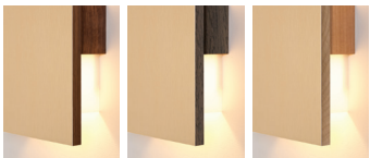
brushed rose gold, walnut brushed rose gold, dark stained walnut brushed rose gold, maple