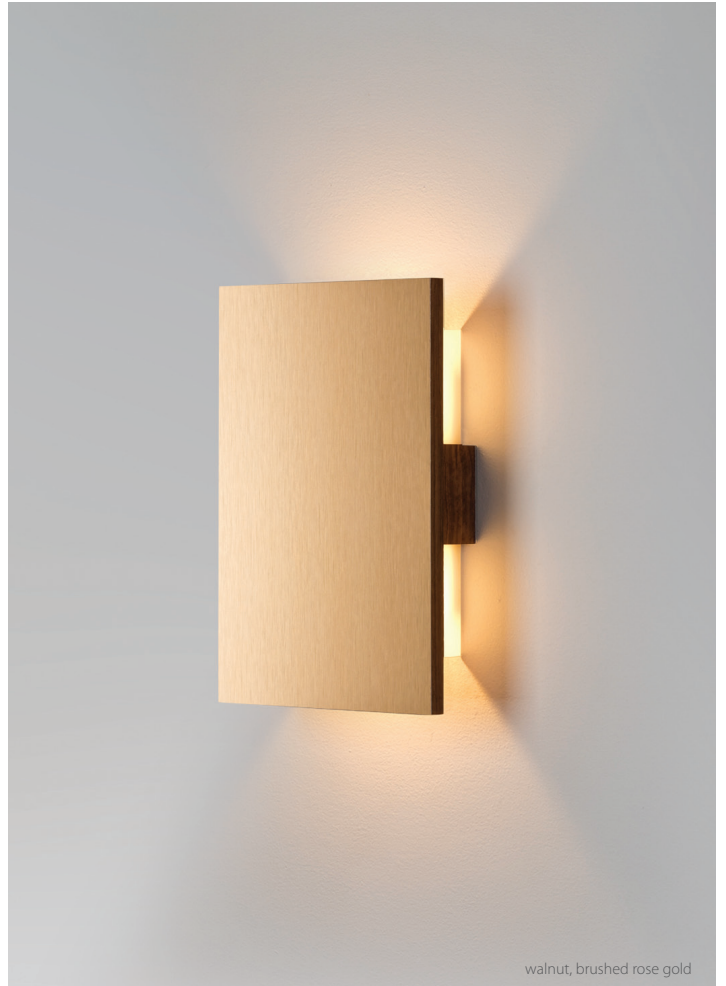
walnut, brushed rose gold