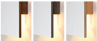
brushed aluminum, walnut brushed aluminum, dark stained walnut brushed aluminum, maple

Dimensions: 10.75" x 7.25" x 2.75" Materials: solid wood, polymer, metal option Product weight: 2 lbs Energy efficient LED light source Light output: 1130 Lumens (source) Light color: 2700 K (warm) or 3500 K (cool) Color accuracy: 90+ CRI LED power consumption: 13W Dimmable (see driver below) Wood grain will vary Specifications subject to change