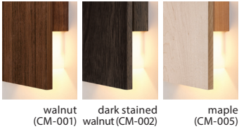
walnut (CM-001) dark stained walnut (CM-002) maple (CM-005)