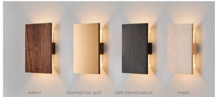
walnut brushed rose gold dark stained walnut maple

The Tersus is an example of the simplest form unlocking a myriad of design possibilities. The long reaching light pattern cast on the wall coupled with the numerous finishes and materials offered makes the Tersus well versed for all kinds of compositions and applications.