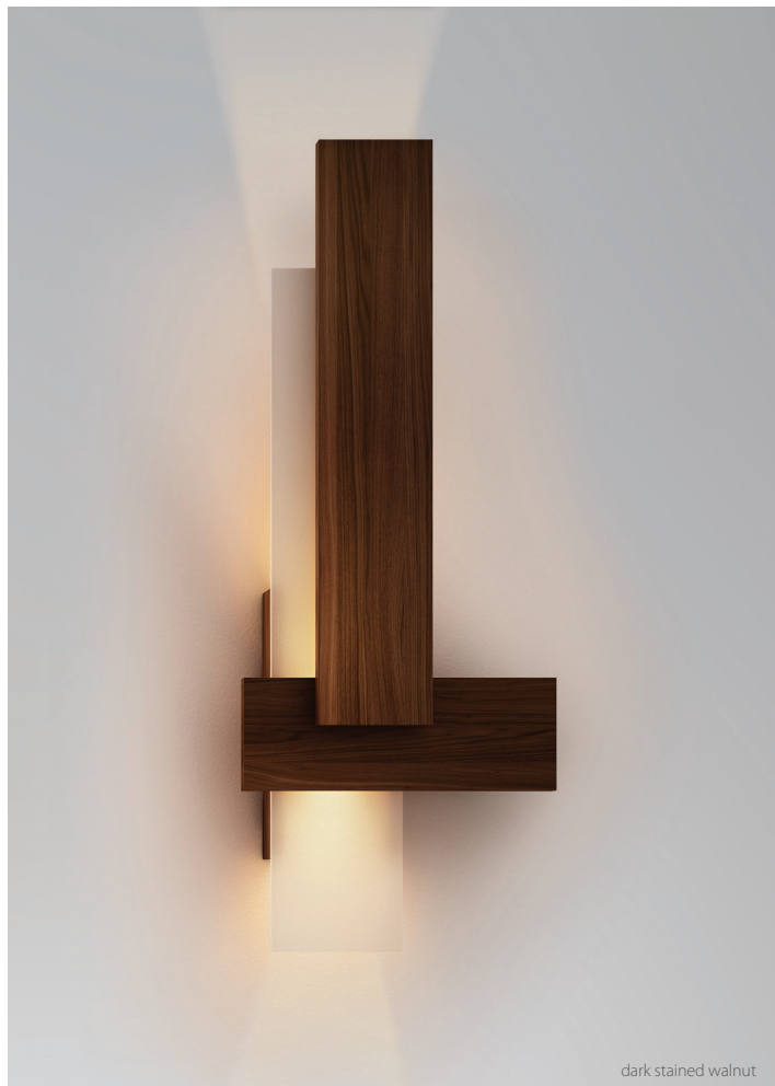
dark stained walnut

Emergency backup option available upon request, requires oversized J-box.