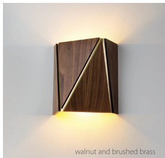
walnut and brushed brass