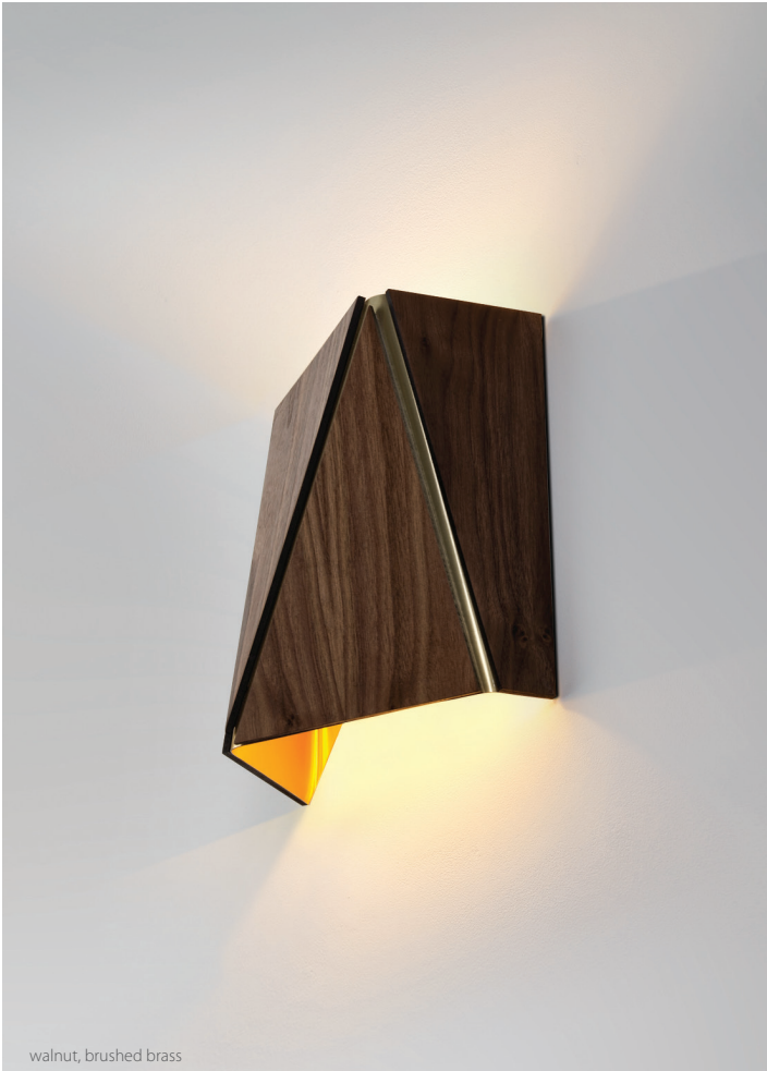
walnut, brushed brass

Inspired by the Calx pendant, again here the materials and method inform the design greatly. While the Calx sconce is clean and simple, it also offers a beautiful texture and subtle complexity to a wall.