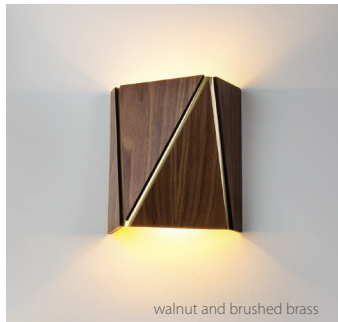
walnut and brushed brass